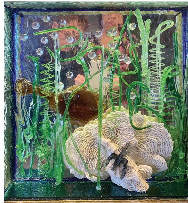
Tears for the Vanishing Coral , 16" x 16" x 2 ½". Collage using mirror, antique glass, real coral, 2018.