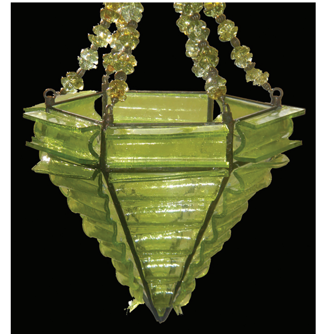
Beersheva Eternal Light, kilnformed antique glass cone. Top width 13" dropping to point 10". Total height with chain 23", 2006.